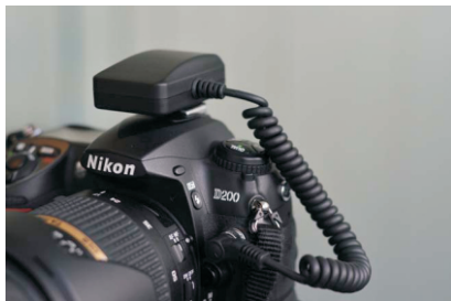
The Geotagger N3 connected to Nikon D200