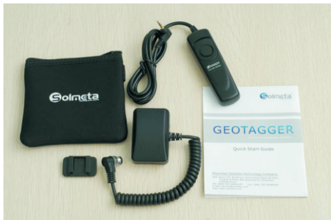
The illustration shows the items of one package of Geotagger N3-A.