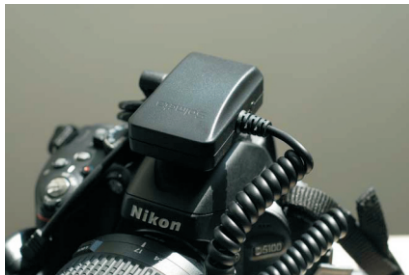
The Geotagger N3 connected to Nikon D5100